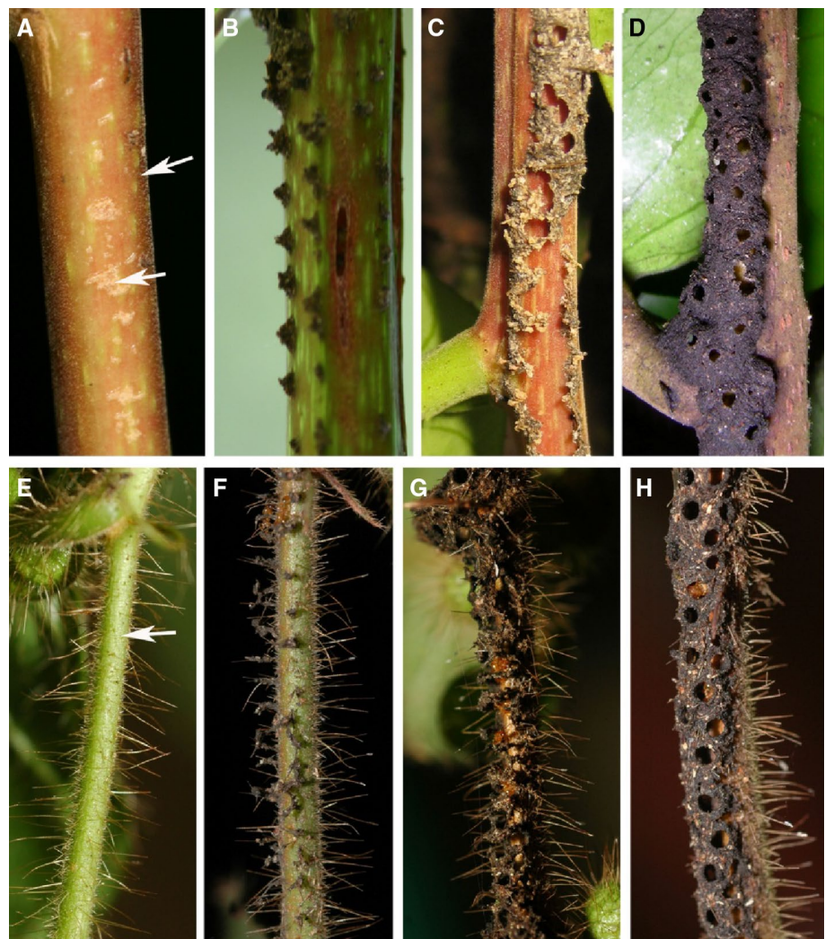
Fig. 1 Construction of the carton galleries by Az. brevis (a–d) and Al. decemarticulatus (e–h). Both ant species start by clearing a path; Az. brevis also scrapes tissue from the bark (arrows) (a, e). Az. brevis uses chewed plant tissue to build rows of parallel pillars (b) and fills the space between (c). Holes are left during the construction process (d). Al. decemarticulatus clears a path by cutting the trichomes (e), which are then used to form the vault of the galleries (f–g). As for Az. brevis , the holes are not pierced after construction but left open during the process (h). The construction process was observed in the field in Costa Rica ( Az. brevis ) and in French Guiana ( Al. decemarticulatus )

For both species, the galleries were similar; i.e., an arched tunnel 2-mm-high and with an inner width of 3–4 mm. For Azteca —as well as Allomerus —built galleries, wall thickness was 0.2 mm, and the walls were perforated with \pm evenly distributed circular holes which were ca. 1-mm-wide for both species, and separated by a distance of 1.3–6.0 mm for Az. brevis galleries and 2.0–4.5 mm for Al. decemarticulatus galleries (Fig. 1d, h; supplementary Table 1). The diameter of the holes was slightly larger than the workers' heads with on average 0.96 mm for Az. brevis galleries and 0.55 mm for Al. decemarticulatus galleries (supplementary